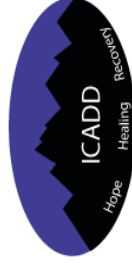
Large logo format:

** Comparative example of organization exposure (not actual size)